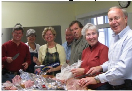
'Ham-ing' it up

Fund raisers such as these help us support the missions of the church. Missions of the church include Shining Lights Learning Center, Epic Church, Meals on Wheels, North Country Home Health and Hospice, Habitat for Humanity, Our Church's Wider Mission (UCC), among others.