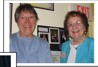
Sunday School available for all ages

Happy Thanksgiving. Christian Education Committee